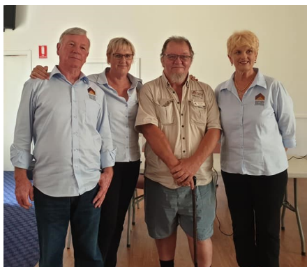
Trundle Zone Meeting (NSW)