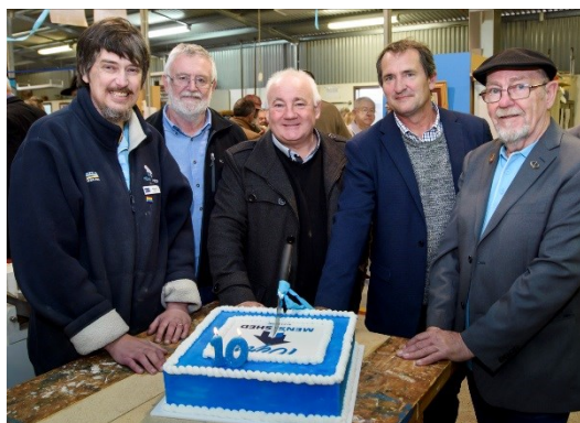
Melton Men's Shed (VIC)