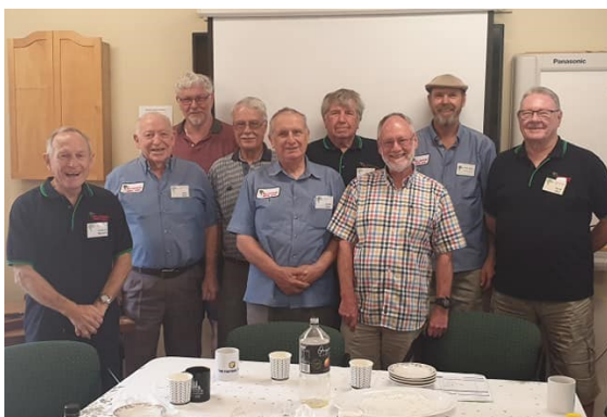
Morning tea at Bellbowrie Mens Shed (QLD)