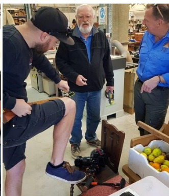
Gosford Men's Shed (NSW)