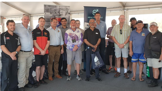
Marking Men's Health Week with the Penrite Racing Team at Hidden Valley Raceway (Darwin, NT)