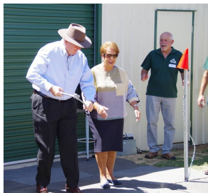
Sir Peter & Lady Cosgrove at Tarago & District Men's Shed (NSW)