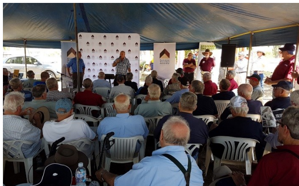
The Mates Shed Roundup at Inglewood Mates Shed (QLD)