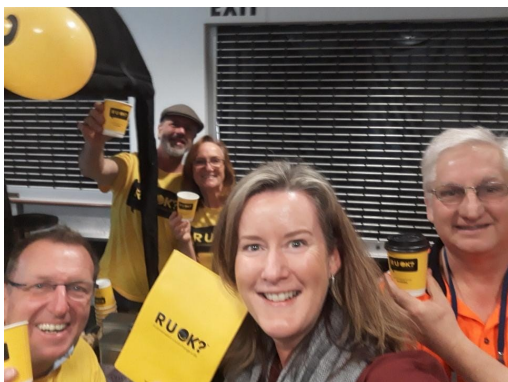
RU OK? Day morning tea at the 8th National Men's Shed Gathering, Adelaide (SA)