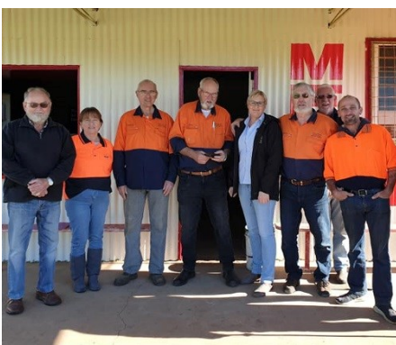
Crystal Brook Community Mens Shed (SA)