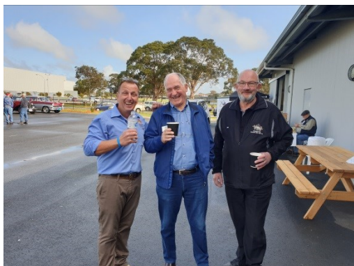
Men's Shed Week Muster, Albany MenShed (WA)

Find us on Facebook for more photos and stories, and to follow our shed tours, visits and adventures in 2020!