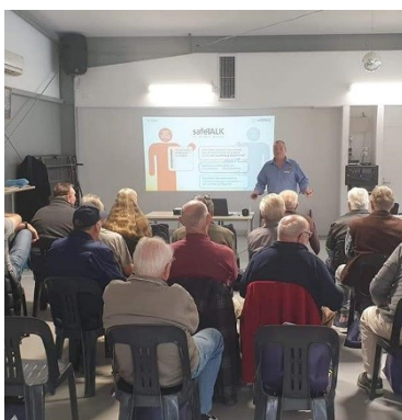
safeTALK community suicide awareness talk at Griffith Shed for Men (NSW)