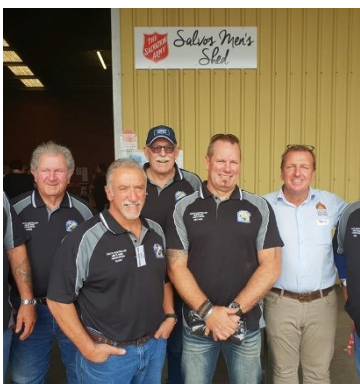
Salvos Mens Shed (SA)